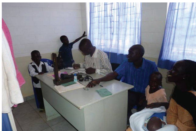
Figure 1. Martha Clinic outpatient clinic.

The Link between Winchester and Eastleigh Healthcare NHS Trust and Yei Civil Hospital and Martha Clinic, and Yei National Health Training Institute has been established since November 2010. Since then our teams of nurses, midwives, doctors, physiotherapists, engineers and other colleagues have carried out multiple trips to Yei. The link has been successful in obtaining a number of grants from organisations such as the Tropical Health Education Trust. We were also successful in obtaining medical text books from British Medical Association for the hospital in Yei.