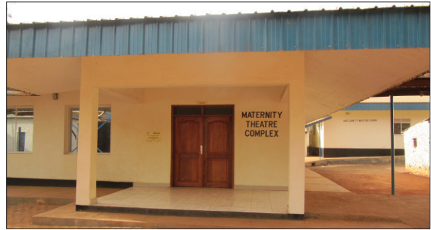
Figure 2. New maternity theatre complex at Wau Teaching Hospital

We go to teach rather than do, but have been able to participate in emergency situations as a result of which lives have been saved. In line with this, we have had funding from the Pharo Foundation to set up a High Dependency Unit (HDU) at the hospital. Work on this project commenced in 2013, and although we couldn't send a full team in 2014 due to security issues in South