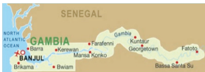
Figure 2. Map of The Gambia

West Africa and in particular, The Gambia, where it is present in over 90% of chronic carriers [10]. The clinical impact of this is yet to be elucidated.