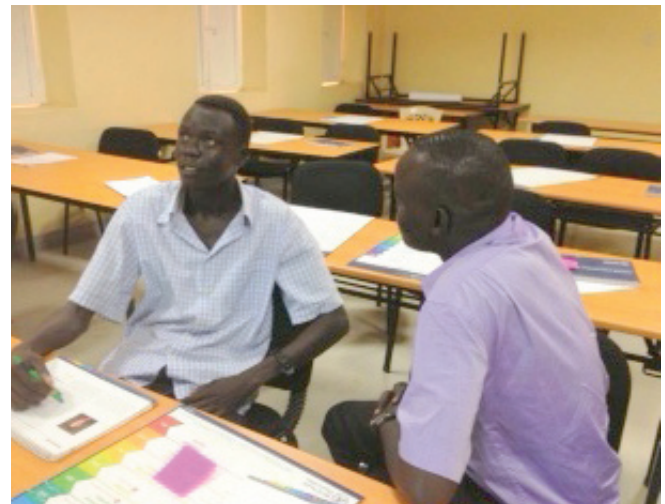
Figure 2. Learning mental health interview skills

Because of these developments we have already provided support for three South Sudanese doctors and a radiographer to gain UK postgraduate experience. We are currently hopeful that a doctor can come to work at St Mary's Hospital in a training capacity for 2 years in medicine under the Medical Training Initiative (MTI) which will pay the standard NHS salary. The Link can provide general support and limited financial help - e.g.