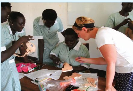
Figure 1. Student midwives at Yei Medical College practice suturing to minimise blood loss from genital lesions

Most readers know that immediate post-partum haemorrhage is a problem in South Sudan as well as Chad (see above article). In Chad the most common risk factor was multiple births and the most common cause was uterine atony. Is this the same in South Sudan? Please send us your experience. Training of medics, mid-wives and nurses is needed to prevent and manage immediate post-partum haemorrhage. Figure 1 shows suturing and Figure 2 shows a less-available method – how to use an uterine balloon device.