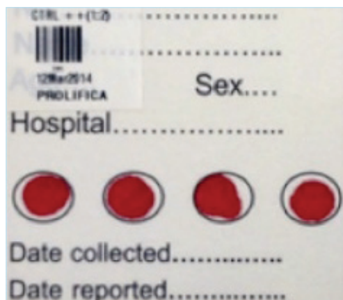
Figure 4. A filled Dried Blood Spot card