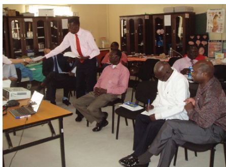
Figure 1. Faculty development at Juba Teaching Hospital

Following BMT and a period of supported work as Medical Officers, doctors will be eligible to apply for Specialist Medical Training. Specialist training will allow a number of options. Doctors may train in one of the secondary care specialties, or