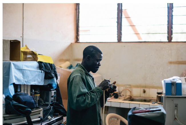
Figure 3. Mending hospital equipment.

Ideas and support are welcome, Donations are welcome to Brickworks, a charity we work with and that raises money for funding the visits and equipment such as the blood bank fridge.