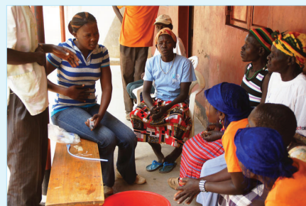
Figure 2. Frontline health workers in Ikotos, South Sudan, receive training in the use of a low-cost uterine balloon device developed by Massachusetts General Hospital's Maternal, Newborn and Child Survival program.

Thanks to Nancy MacKeith for helping to prepare this note and the article on page 28.