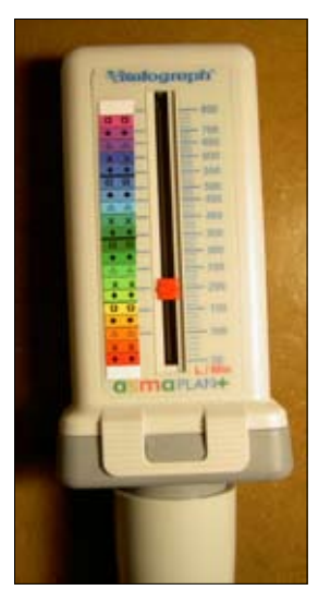
Figures 1a and b. Example of a colour coded peak flow meter and chart for home use by illiterate patients.

taking. Lack of funds, fear of side effects or lack of understanding of the need to take regular medication may result in the patient taking a much lower dose of drug than that prescribed, or stopping the medication when the symptoms resolve. It is important to: