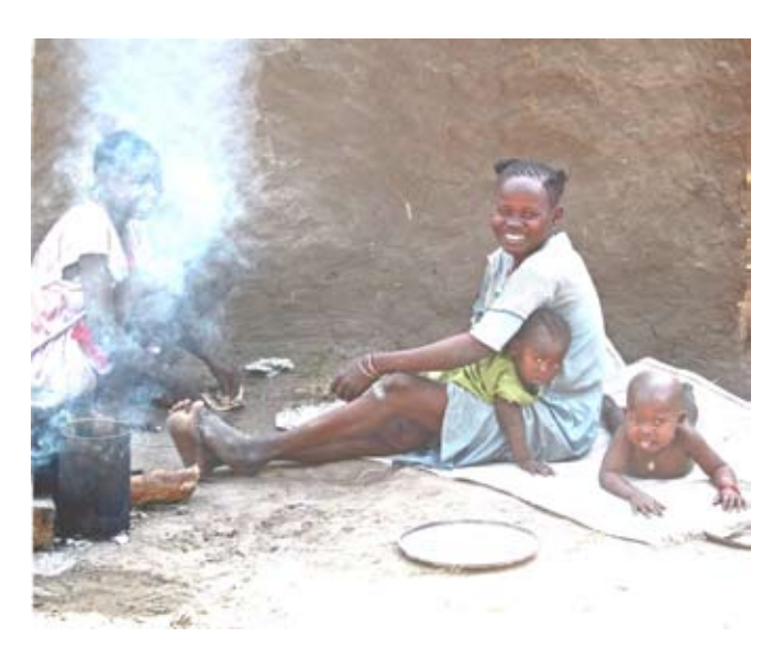
Figure 2. Inhalation of smoke from biomass fuel may cause respiratory disease in adults and children.

• Allergens may be an important cause of asthma. In 2003 locusts were associated with 11 deaths and 1600 hospital visits in central Sudan. Asthma and rhinitis in Sudan has also been associated with exposure to airborne allergen from the "green nimitti" midge Cladotanytarsus lewisi. Urbanisation is associated with an increase in exposure to indoor allergens such as the house dust mite or pet dander (2), and increased air pollution increases sensitisation to allergens.