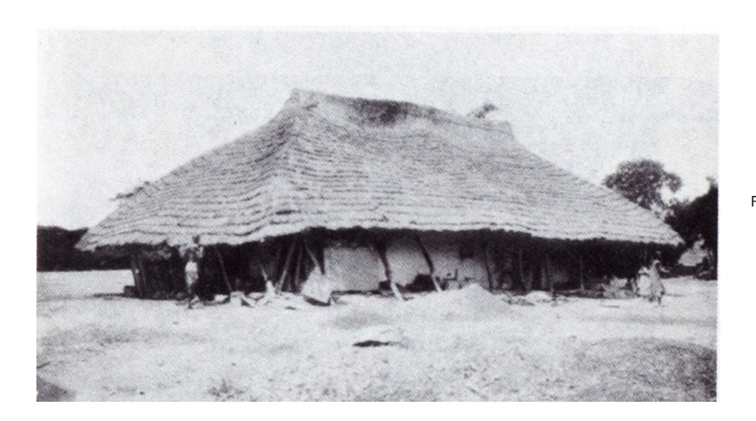
Figure 2. The old hospital, Lui

them out of the packing materials they came with. The beds were local bamboo structures.