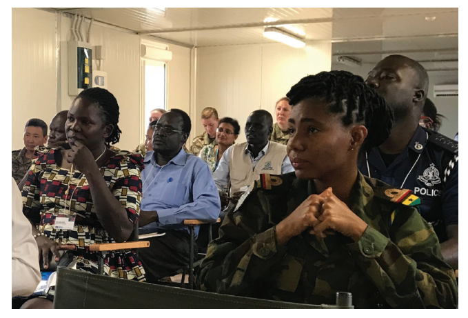
Figure 1. The symposium was an interactive forum to share knowledge and exchange ideas about health in Unity State.

The people of Unity State have experienced a protracted humanitarian emergency, including famine, conflict, economic crisis and disease outbreaks. Access to health services across the state is low with many people living several days by foot from the nearest medical office. The situation is exacerbated by the mass displacement of people who have fled their own homes for safety. The UN estimates that there are over 500,000 internally displaced people (IDPs) in Unity State alone <sup>[1]</sup>. The international community has responded to this crisis in Rubkona County, by establishing the Bentiu Protection of Civilians (PoC) site to ensure the security of at least 120,000 IDPs at any one time. Clean water, sanitation and hygiene are significant challenges within the PoC site, contributing to outbreaks of vector borne diseases, acute