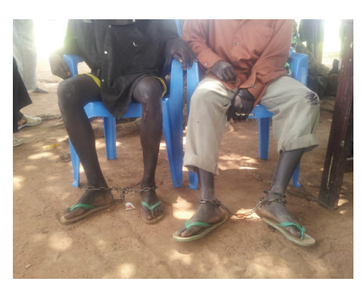
Mental health patients kept in chains (file photo - South Sudan)

The Ministry of Health can invest in mental health by improving mental health services, and training mental health practitioners. There is also a need for public health education to increase mental health awareness through campaigns and community initiatives. This will go a long way in reducing stigma and empowering people to recognise the signs of mental health disorders. Counselling, psychosocial support and training should be made available to the displaced or those living in towns and villages that have recently been under attacks of violence. Training professionals and mental health workers within communities will ensure that these important services are made available to those in very remote areas, which are lacking in access to healthcare in general. The impact of mental health disorders on South Sudanese society has devastating and far-reaching consequences. For the country to have long-lasting peace and a productive society, a healthy population is not an option, but a necessity.