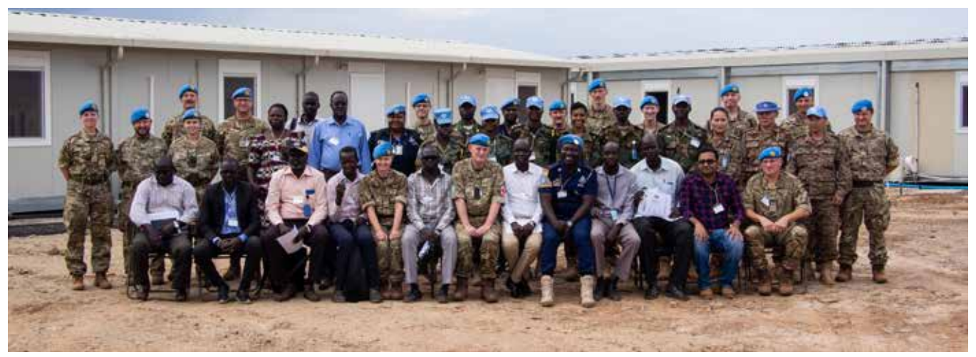
Figure 3. The participants of the Bentiu International Health Symposium outside the new UN Level 2 Hospital.

Gender Based Violence (SGBV) face in accessing health services within Bentiu PoC site. SGBV refers to nonconsensual penetration of the vagina, anus or mouth with any body part. The majority of SGBV survivors are women, who are often at greatest risk of assault when leaving the PoC to collect firewood. The consequences of SGBV to the survivor can be far-reaching. Sexually transmitted infections (STIs) and psychological trauma are common. Assaults resulting in pregnancy may lead to abuse by family members, forced marriage and abandonment of newborn children. Health services within the PoC can provide emergency contraception, post-exposure prophylaxis against HIV, STI treatment and psychological support. However, many SGBV survivors feel ashamed and fear stigmatisation by their family and community if they seek help. Mistrust of PoC health agencies and a lack of literacy also constitute barriers to accessing medical care. Health workers should promote accessibility by ensuring that they are both non-discriminatory and confidential. The Nonviolent Peaceforce support and advise SGBV survivors to ensure they receive the treatment they require.