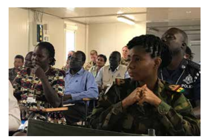
Figure 1. The symposium was an interactive forum to share knowledge and exchange ideas about health in Unity State.

The people of Unity State have experienced a protracted humanitarian emergency, including famine, conflict, economic crisis and disease outbreaks. Access to health services across the state is low with many people living several days by foot from the nearest medical office. The situation is exacerbated by the mass displacement of people who have fled their own homes for safety. The UN estimates that there are over 500,000 internally displaced people (IDPs) in Unity State alone [1]. The international community has responded to this crisis in Rubkona County, by establishing the Bentiu Protection of Civilians (PoC) site to ensure the security of at least 120,000 IDPs at any one time. Clean water, sanitation and hygiene are significant challenges within the PoC site, contributing to outbreaks of vector borne diseases, acute