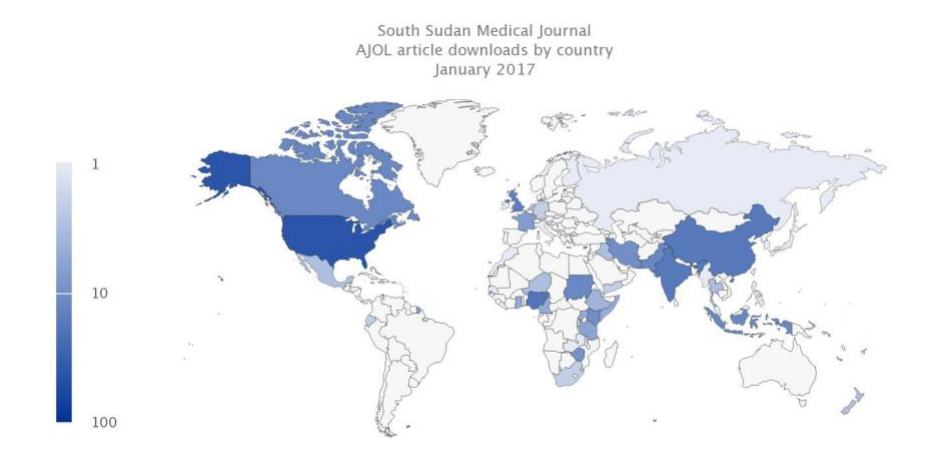
Figure AJOL 2a. Number of articles downloaded by country in February 2017 (note: scale 1-100)

The maps in Figures 2a and b show that the countries with the greatest the number of downloads has changed (and increased) between 2017 and 2021.