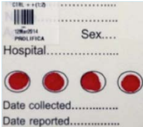
Figure 4. A filled Dried Blood Spot card