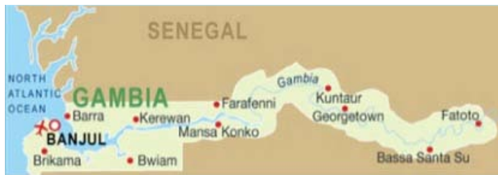
Figure 2. Map of The Gambia

West Africa and in particular, The Gambia, where it is present in over 90% of chronic carriers [10]. The clinical impact of this is yet to be elucidated.