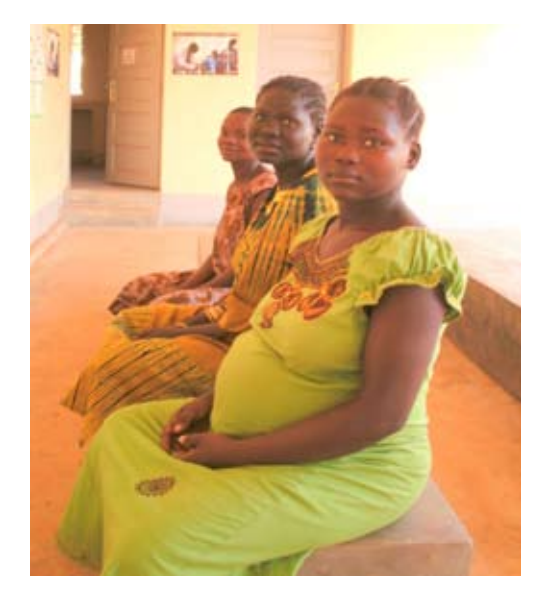
Figure 1. Ladies at the new ante-natal clinic

The position of the head can adversely affect the progress of labour. If it is tilted (asynclitic) or erect instead of flexed (this is sometimes called military!) the head will not stimulate regular effective contractions. During training midwives should learn all the possible positions of the head and how to feel for them.