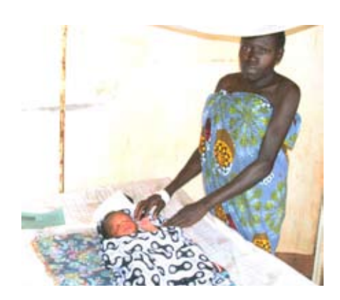
Figure 3: Woman and baby after an elective section in Yei Civil Hospital

live near the hospital until they deliver may reduce maternalmortality from obstructed labour. systematic review of primary level referral systems for emergency maternity care developing countries found that maternity waiting homes