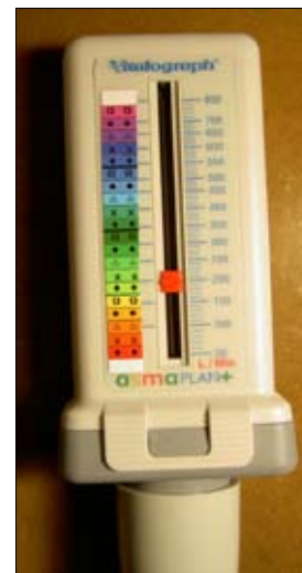
Figures 1a and b. Example of a colour coded peak flow meter and chart for home use by illiterate patients.

taking. Lack of funds, fear of side effects or lack of understanding of the need to take regular medication may result in the patient taking a much lower dose of drug than that prescribed, or stopping the medication when the symptoms resolve. It is important to: