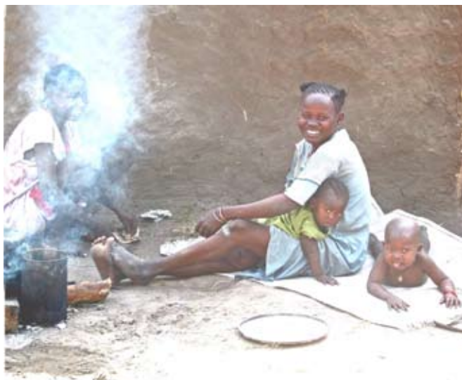
Figure 2. Inhalation of smoke from biomass fuel may cause respiratory disease in adults and children.

• Allergens may be an important cause of asthma. In 2003 locusts were associated with 11 deaths and 1600 hospital visits in central Sudan. Asthma and rhinitis in Sudan has also been associated with exposure to airborne allergen from the “green nimitti” midge Cladotanytarsus lewisi . Urbanisation is associated with an increase in exposure to indoor allergens such as the house dust mite or pet dander (2), and increased air pollution increases sensitisation to allergens.