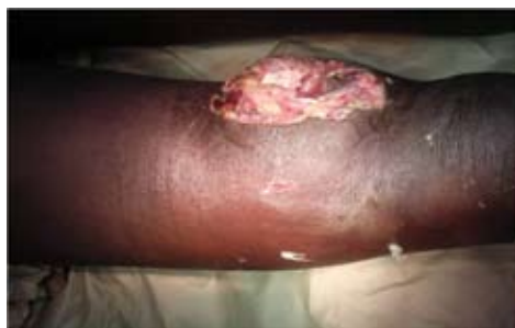
Figure 3. Open fracture of the distal end of the left femur due to gunshot

The high burden of trauma injury is still taxing the