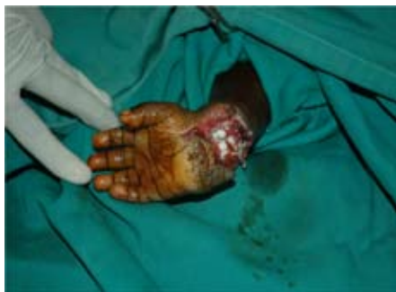
Figure 5. Compound fracture of the right wrist joint following RTA. See exposed carpal bones.