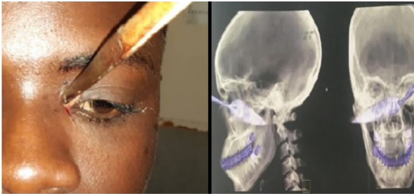
Figure 1. Preoperative view PA and LV X-rays of the skull