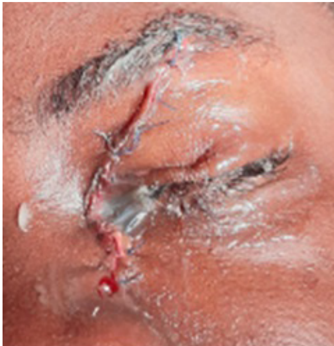
Figure 5. Tarsorrhaphy on the left eye.