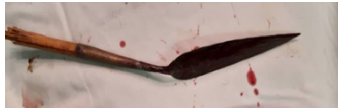
Figure 4. Foreign body extracted from the wound.