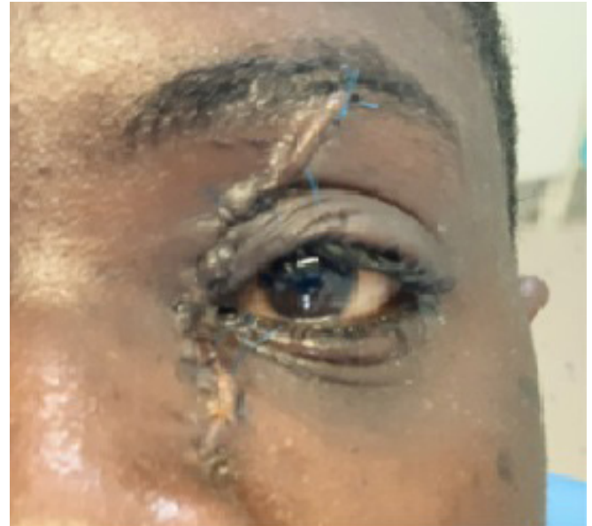
Figure 6. Satisfactory postoperative progression

assessment of damage to vital structures. Then appropriate laboratory and radiographic investigations may be performed. A detailed history of the events leading to the injury should be obtained from the patient, witnesses, or family. This should reduce the chance of a penetrating injury being overlooked. Complete examination of the head and neck region should be performed, with care taken to explore any wounds that appear more than superficial. Patients may often present with other knife wounds to the hands and thoraco-abdominal areas.