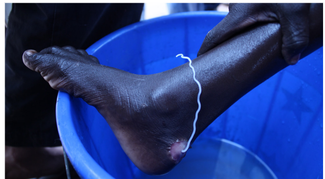
Figure 1. Guinea worm emerging from the foot of a patient in South Sudan

Despite a prolonged civil war, there was a 95% reduction in reported cases of GWD in South Sudan between 1995